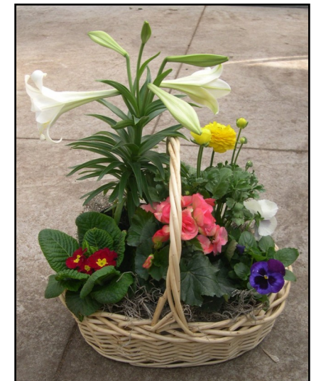
*Spring Lily Combo Basket

Delivery dates April 14, 2011 through April 23, 2011, just in time for Easter.